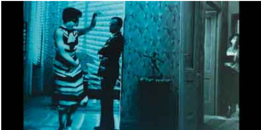
HD video screen 18/9 - aspect ratio of 1: 2 - and "THE CONFORMIST" directed by Bernardo Bertolucci. Filmed in 1:1,66.