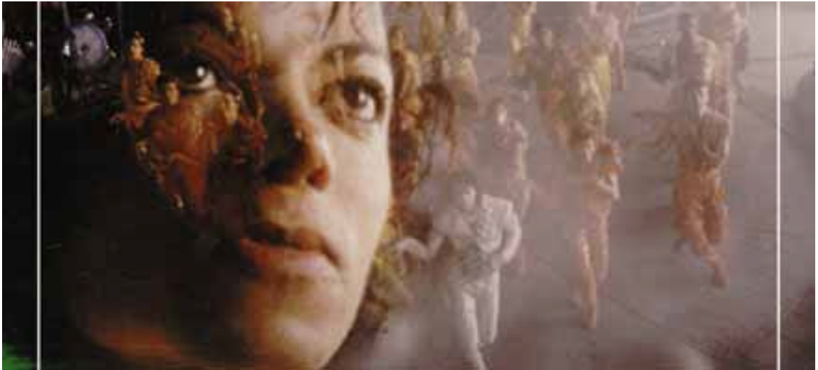
Film "CAPTAIN EO" directed by Francis Coppola. Relationship between 65mm aspect ratio 1: 2,21 and the aspect ratio of 1: 2.