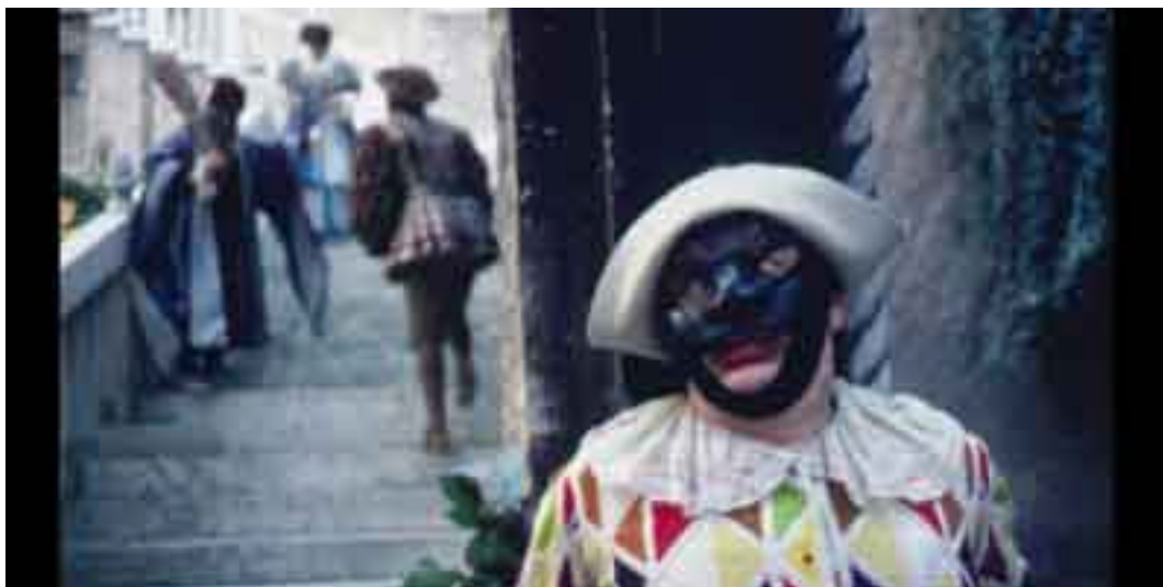
Film "ARLECCHINO" directed by Giuliano Montaldo. Relationship between HDVS aspect ratio 1:1,79 and the aspect ratio of 1:2

This new aspect ratio or format will respect not only all Co-Authors who participate in the creation of Images but also all audiences with their own right to see a picture as it was conceived, and this new format will allow us to readily compose any new image in the future without being affected by the media used, or on which screen it will be projected. In any case the image will eventually end up on Laser Disc, HD in the same Composition. We can also fit into this electronic screen any past films from the silent era, filmed in 1:1,33 or Academy 1:1,375 to all panoramic systems, including 1:1,66 - 1:1,75 - 1:1,85 anamorphic and 65 mm pictures will only have a very small modification on the sides.