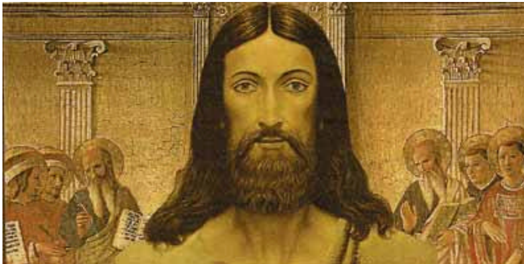
Film "MESSIAH" to be filmed in Epic UNIVISION 65mm Gate 24x48mm Aspect ratio 1:2.