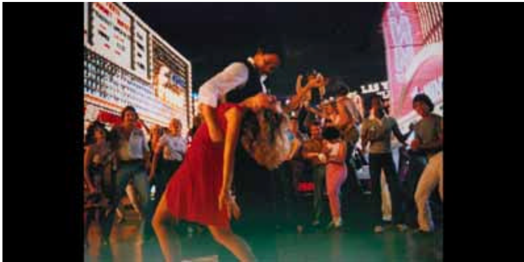
HD video screen 18/9 - aspect ratio of 1:2 - and "ONE FROM THE HEART" directed by Francis Coppola. Filmed in 1:1,375